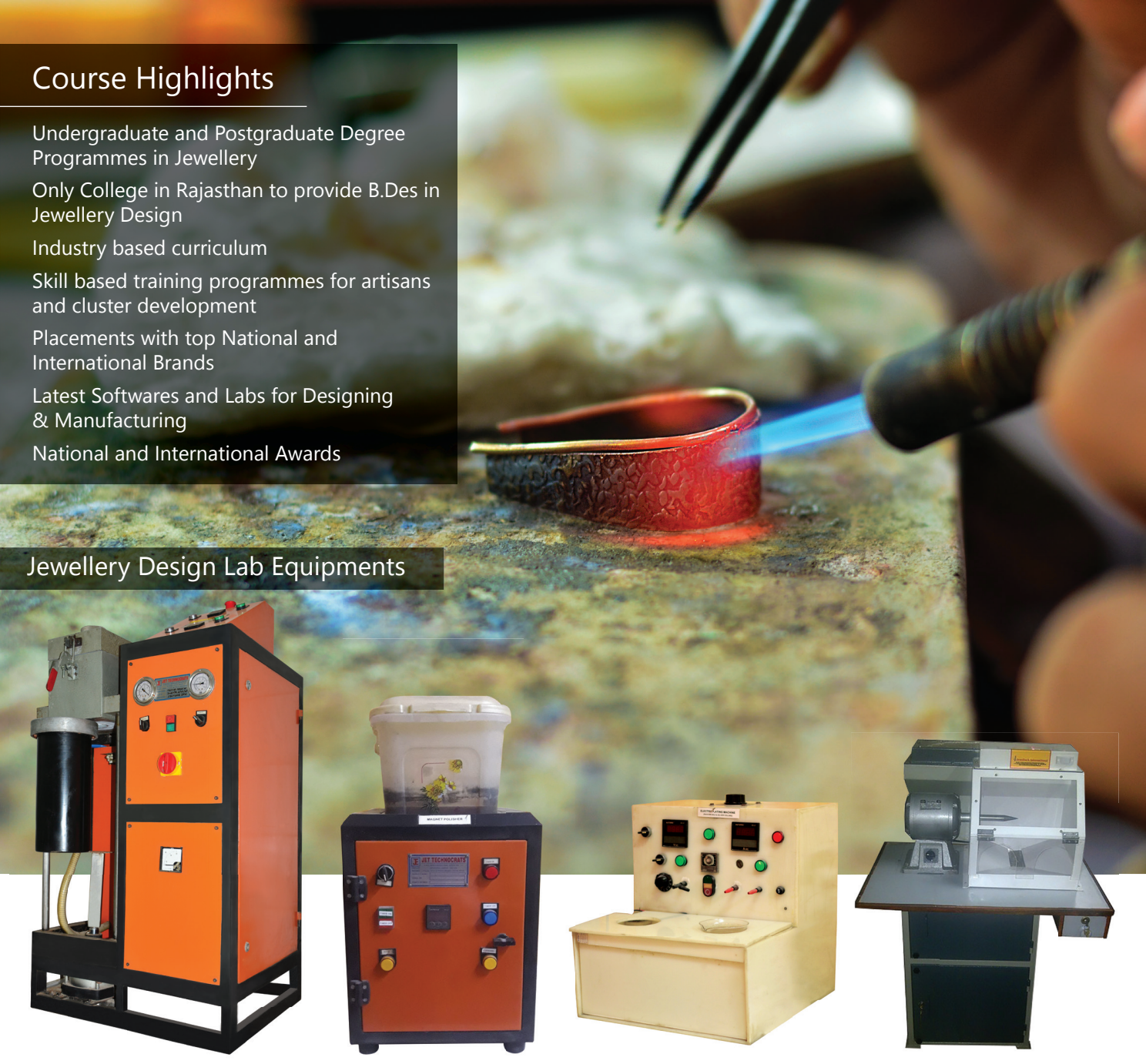
Jewellery Casting Machine