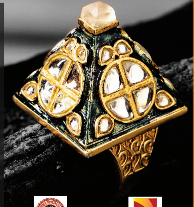
Affiliated to University of Rajasthan

Enamelling Workshop | Kundan Meena Jewellery Project Fine Jewellery Project | Wax Setting & Stone Setting Jewellery Design through Advance 3D (3Design) Jewellery Design through 3D (Jewel Cad)